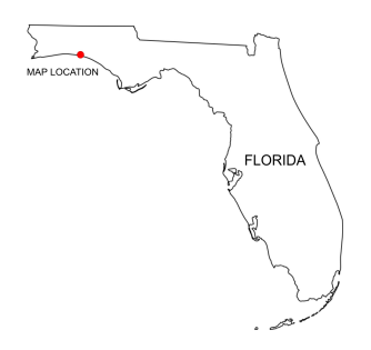
Tsunami Sources Modeled for the Destin coastline