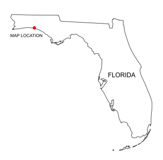
Tsunami Sources Modeled for the Okaloosa Island coastline