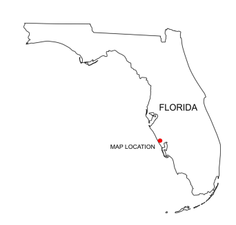
Tsunami Sources Modeled for the Captiva Island coastline