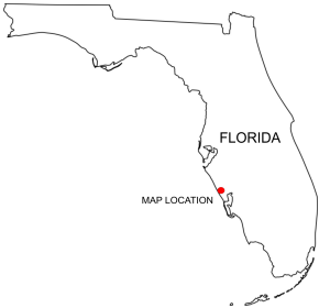
Tsunami Sources Modeled for the Don Pedro Island-Boca Grande coastline