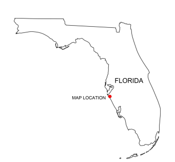
Tsunami Sources Modeled for the Siesta key coastline