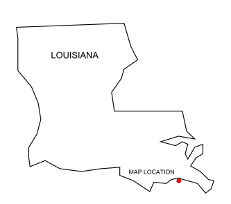
Tsunami Sources Modeled for the Grand Isle coastline