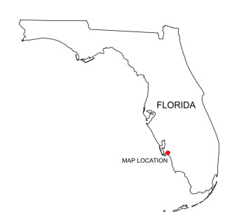
Tsunami Sources Modeled for the Naples coastline