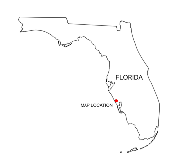
Tsunami Sources Modeled for the Englewood coastline