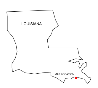
Tsunami Sources Modeled for the Grand Isle coastline