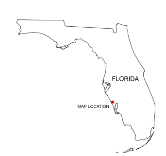
Tsunami Sources Modeled for the Englewood coastline