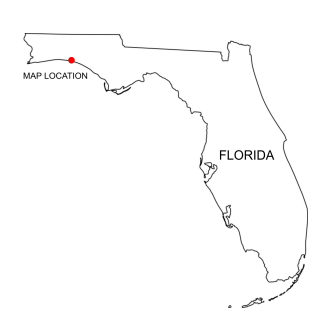
Tsunami Sources Modeled for the Destin coastline