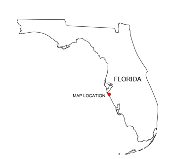
Tsunami Sources Modeled for the Siesta key coastline