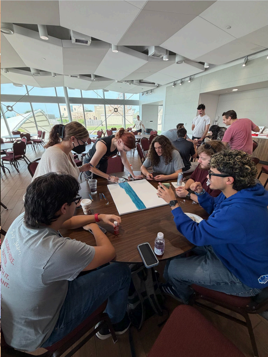
Spring CL Training