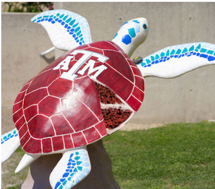
Spirit of AggieLand's Red Velvet Insides

One of the 50 Kemp's Ridley sea turtle statues has been discovered to be cake. Sources say that the Spirit of AggieLand turtle is made of a red velvet and french lemon-orange buttercream frosting. This community project of Galveston's turtle statues is sponsored by local businesses and organizations. Turtle Island Restoration Network, Clay Cup Studios, and local artists have all worked to promote conservation efforts to protect sea turtles since 2018.