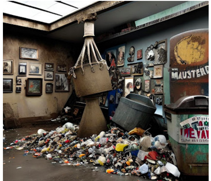
Trash Museum Preview

The Galveston Sea Turtle Conservation Center has opted to open a museum for recovered waste. As of now, the museum will include many volumes of recovered trash, such as but not limited to: plastic straws, grocery bags, and other plastic materials. Among the overwhelming support coming from the turtles, Loggerheads and the Green variation have both commented, saying they find the idea to be "innovative," and "makes them want to consume trash for a chance to be featured in the museum."