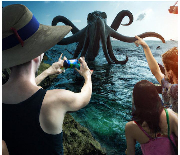
Moments before abrupt chaos

In the Gulf waters that lie between Galveston and Pelican Island, giant tentacled eldritch horror Cthulhu has been sighted trudging through the waves and mist between the islands' shores. Island inhabitants who beheld the approach of the gargantuan tentacled monster reportedly went insane. Ports were demolished, docks splintered, and ships upturned. Scientists are scrambling to find an effective way to track the eldritch being's path of travel, and cult activity is on the rise in the name of this widely renowned Lovecraftian terror that has gone from a fictional nightmare to a petrifying and madness-inducing reality.