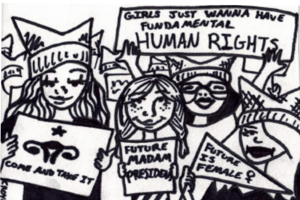
Illustration by: Amber Croyl

The Houston Women's March in just ten days, according to a Facebook event of the same name, rallied over 22,000 men, women, and children of all different nationalities, races,