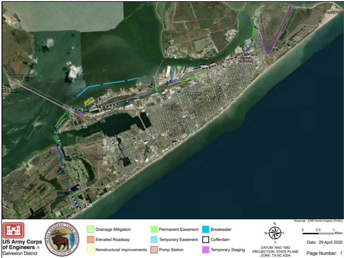
Figure 5-1. Footprint and features of the proposed Galveston Ring Barrier

The Galveston Seawall, which forms the Gulf side of the Ring Barrier, is to be raised to an elevation of 21 ft. The rest of the Ring Barrier is presently comprised of concrete floodwalls (inverted T-walls) having a crest elevation of 14 ft, with retractable navigation gates and environmental gates that open into Offatts Bayou. The USACE Plan includes a number of features to promote internal drainage and retractable gates across roads and rail lines. Detached breakwaters are being considered, where the bay side of the Ring Barrier is most exposed to waves generated within Galveston Bay. The apparent purpose of the breakwaters is to reduce wave energy that reaches the floodwall, reducing wave overtopping to acceptable levels. As part of the Plan, a series of pump stations are to be located along the bay side of the Barrier. The pumps evacuate water that accumulates inside the Ring Barrier, discharging it over the floodwall and into the bay. In general, the City has to get the water near the barrier (i.e. near the pump stations) – the New Orleans problem. This could be a problem in Galveston if the interface with the City’s interior drainage system is not well coordinated, planned and designed. All figures and tables presented in this chapter were extracted from the Feasibility Report.