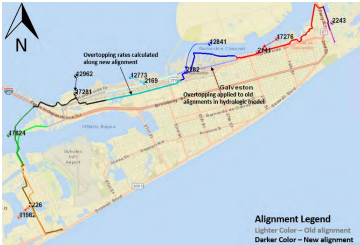
Figure 5-3. Reaches consider in designing the Galveston Ring Barrier

Table 5-1 shows the calculated design WSEs and significant wave heights, for the different reaches shown in Figure 5-3. The 90% confidence limit (CL) values correspond to the adopted design standard. All design WSEs shown in Table 5-1 are for the present sea level. Table 5-2 shows calculated overtopping rates, 50% and 90% CL values, for the 100-yr wave and water level conditions, representing both present and future sea levels. Overtopping values in Table 5-2 utilized the WSEs and wave heights from Table 5-1, and a 2.1 ft increase in water level was used to represent the effects of rising sea level for the intermediate rise scenario.