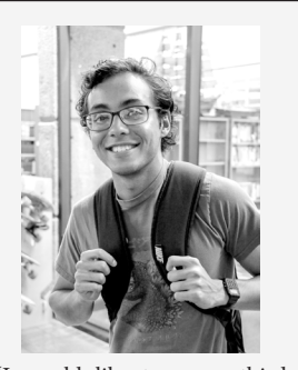
"I would like to see a third party candidate in office, but I don't think he would have enough influence."

Want your opinion heard? Look out for THE NAUTILUS around campus for your chance to be featured in the next Naut Asks!