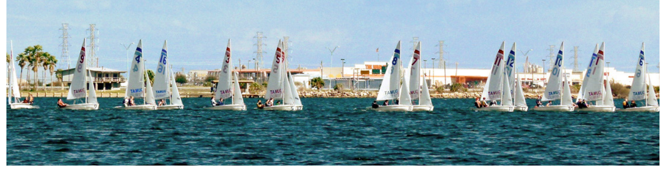
The TAMUG sailing team practicing in their fleet of 420's near the Teichman facility.

Many Aggies are not aware that our sailing team actually holds the varsity title for the entirety of Texas A&M. This year the team prepares to repeat history and go to Nationals as they have for the last five years. As if placing top 20 in the nation isn't enough, the sail-