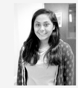
"I think [third party candidates] are a good option, but he does not stand a chance due to lack of support."