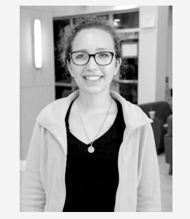
"I'm in Political Science... It is just not possible for a third party candidate to win the election."