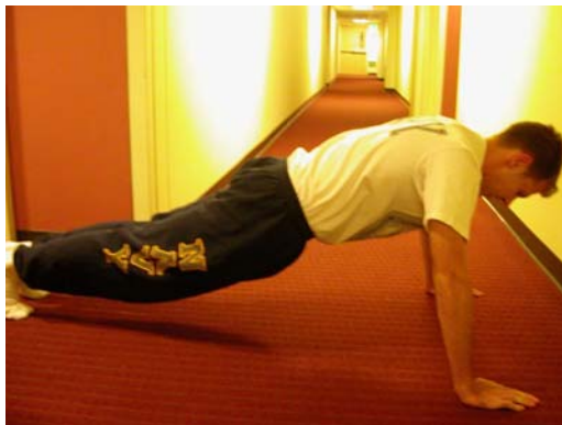
Shoulders And Lower Back Are Aligned