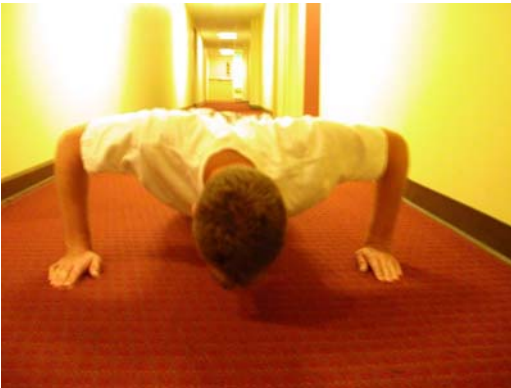
Proper "Down" Position With Upper Arms Parallel To The Deck