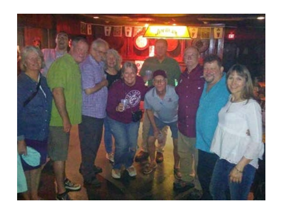
Sea Aggie Former Student Reunion September 2018