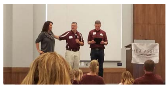
Ring Day September 2018